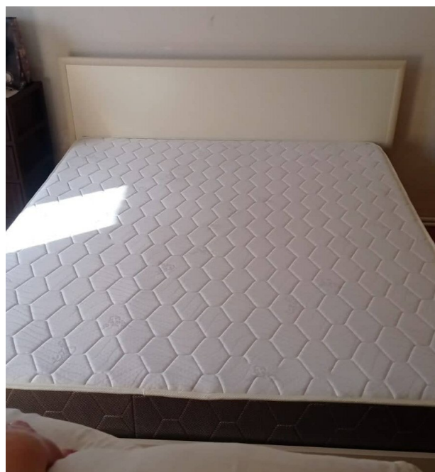
Image of one of the beds, with special mattress.

We made the decision of donating a bed to him.