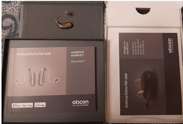
The hearing aid.