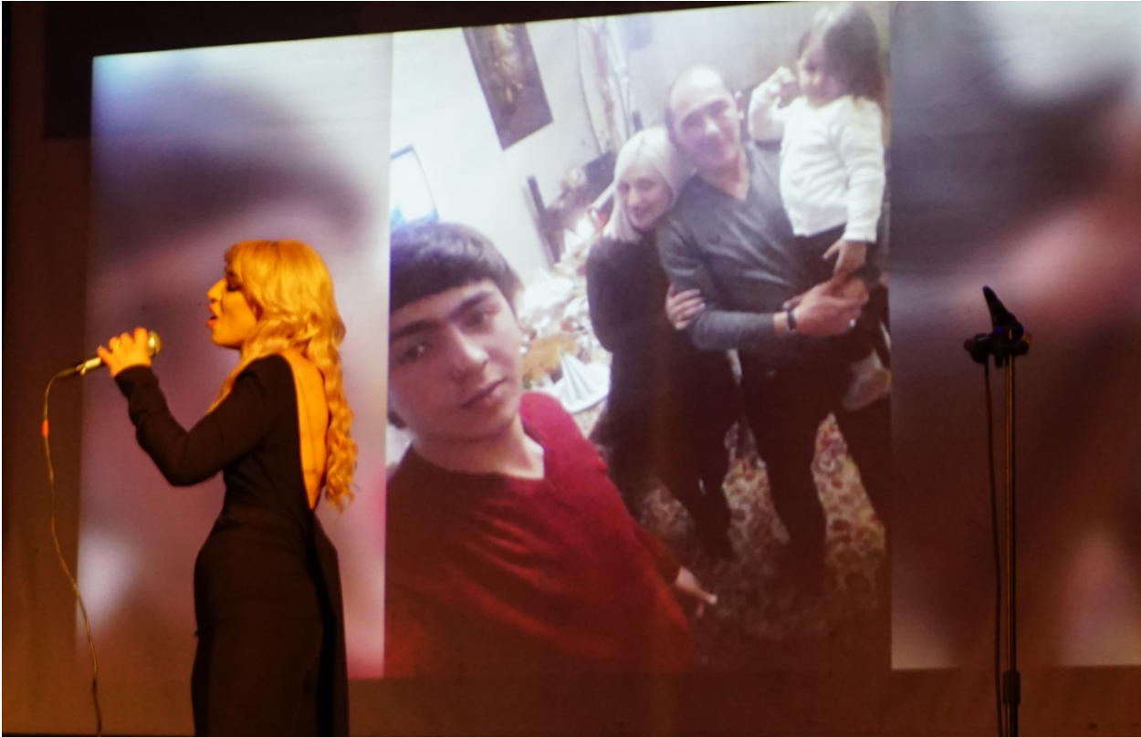
The bereaved mother singing against the background of the image of her family and son (18).